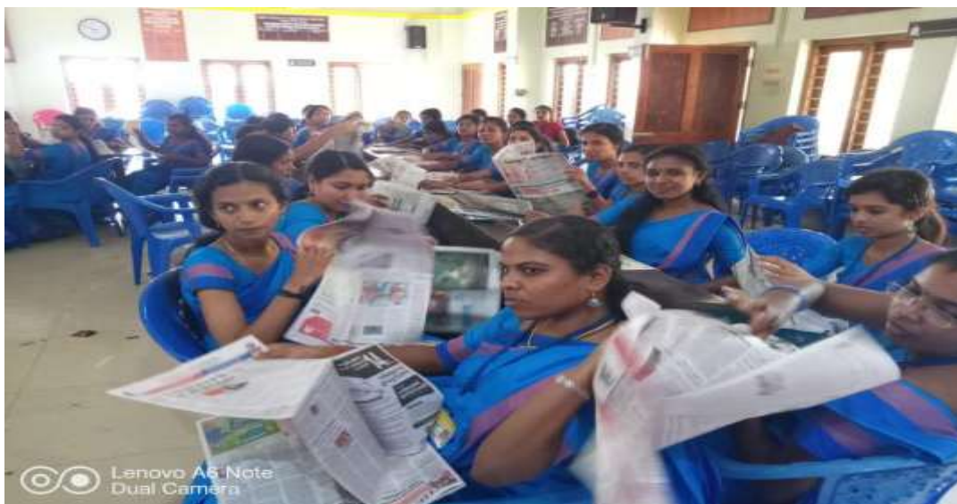
Student Teachers attending the Training Programme on Paper Bag preparation