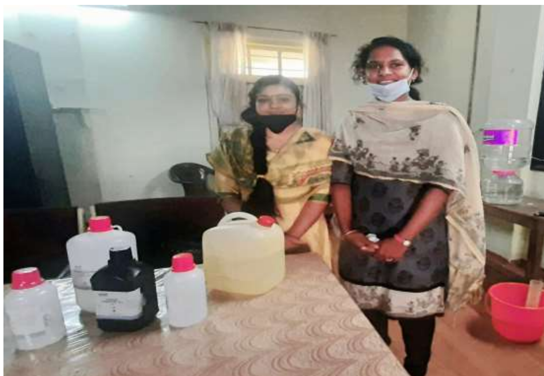
'In Action': Student Teachers in the midst of preparation of Hand Sanitizer

Department of Physical Science of Sree Narayana Training College initiated to prepare Hand Sanitizer and distributed the same to the College authorities which was really worth for the Staff and students of the College. The college was self-reliant in protesting the Pandemic by making Masks and Sanitizer with the well-coordinated support of Students and Staff. A Part of the Sanitizer prepared was supplied to neighbouring schools also.