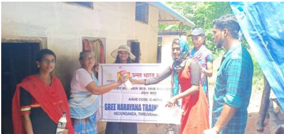
Students distributing cleaning lotion prepared by them under UBA activity to village people

Under the leadership of UBA Cell, in collaboration with the Gandhi Study Unit of Sree Narayana Training College, Nedunganda, the Cell members prepared cleaning Lotion by using Swadeshi products on October 2nd , 2019 and initiated to distribute the same in the nearby locality. The programme enabled in triggering out the spirit of Community Service among student teachers.