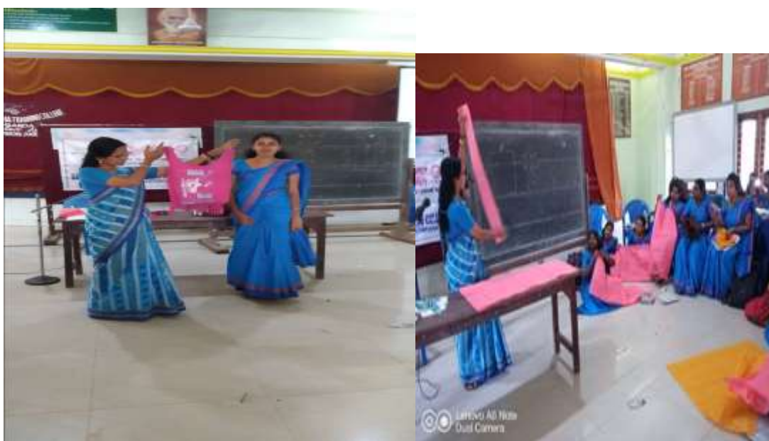
Student Teachers involving in the making of Cloth Bag